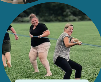
MONTHLY FAMILY ACTIVITIES