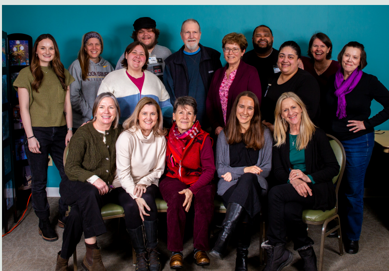
CLASS OF 2024 MEDIATORS

To apply, call our office or visit our website.